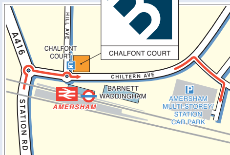
Our entrance can be accessed off Hill Avenue

Exit the M40 at Junction 2 and follow the signs for 'Amersham, A355'. At Pyebush Roundabout take the first exit and join the A40. At the roundabout take the second exit and join the A355. Continue on the A355 towards Amersham. At Shardeletes Roundabout take the second exit onto the A355. At Tesco Roundabout take the third exit onto A355. At the next roundabout take the first exit onto the A416. At the roundabout immediately after the railway bridge take the second exit. At the next roundabout take the second exit. Turn right onto King George V Road. Amersham Multi-Storey/ Station car park is on your right.